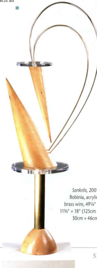
Sankofa , 2001, Robinia, acrylic, brass wire, 49¼" × 11¾" × 18" (125cm × 30cm × 46cm)