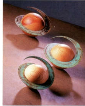
Evolution of a Mind , 2001, Pine, brass, largest is 6¾" (17cm) diameter